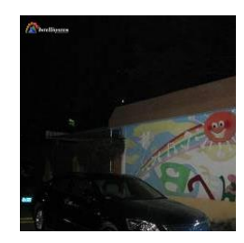
With white light